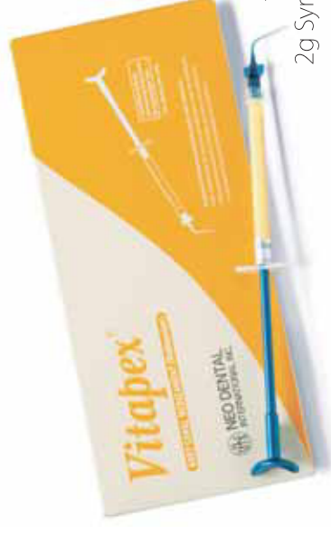
Vitapex Tips Set 2g Syringe + 20 tips