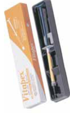
Vitapex Refill 2g Syringe