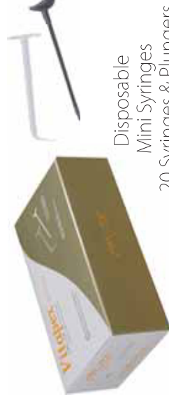
Disposable Mini Syringes 20 Syringes & Plungers